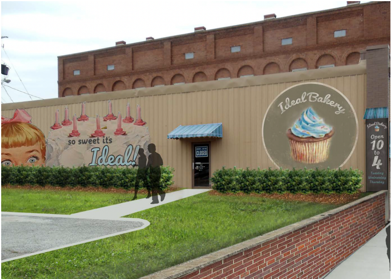
The image above is a conceptual render completed by the University of Georgia in 2013. The parking lot is expected to undergo reconfiguration in 2024/2025.